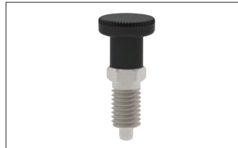
Stainless with plastic grip