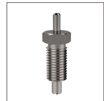
Threaded for bespoke handle