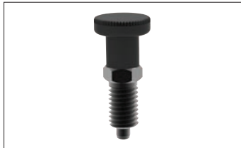
Steel with plastic grip