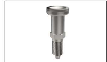
Stainless body and grip