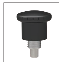
Thin wall mount