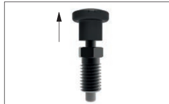
Non locking (spring back)