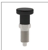
Fine threaded (standard)