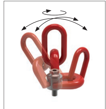
Triple swivel - threads M8 – M56 loads 0,3 tons – 22 tons