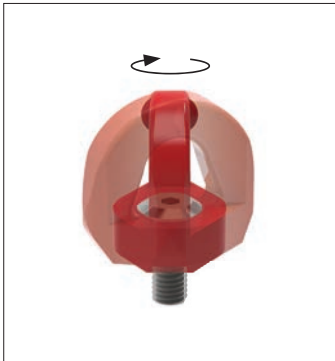
Single swivel - threads M8 – M48 loads 0,3 tons – 15 tons

The Swivel Lifting Rings come in three main forms – depending on the number of axis required to swivel. The most popular type is the double swivel rings.